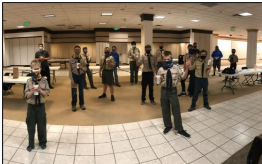
Troop Meeting at the Chapel Hills Mall April, 2021